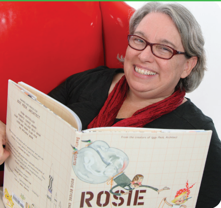
Andrea Beaty ✨ Youth Services Forum Author Breakfast Wednesday, October 23

Eugenia Cheng is a mathematician and concert pianist. She is Scientist in Residence at the School of the Art Institute of Chicago and won tenure at the University of Sheffield, UK. She has previously taught at the universities of Cambridge, Chicago and Nice and holds a PhD in pure mathematics from the University of Cambridge. Alongside her research in Category Theory and undergraduate teaching her aim is to rid the world of "math phobia." Her latest book, The Art of Logic in an Illogical World was released in July of 2018.